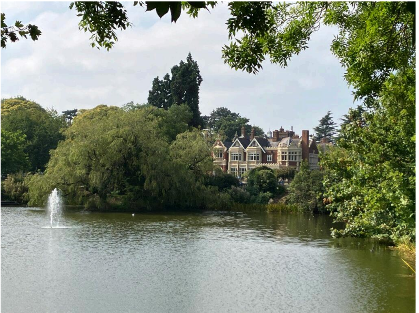
Bletchley Park Mansion