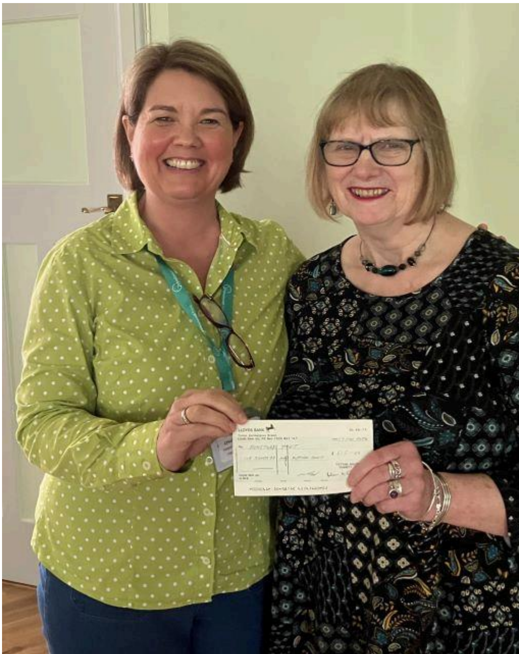
2024-05-17 Cheque Presentation

It was also announced following the AGM that Totton South members have chosen "Hampshire and IoW Air Ambulance" as Charity of the Year for 2024-25.